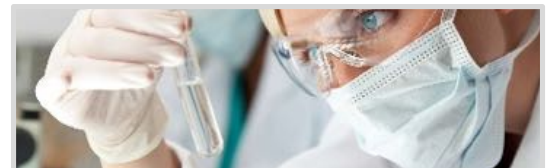
Quality Assessment Products (QAPs)