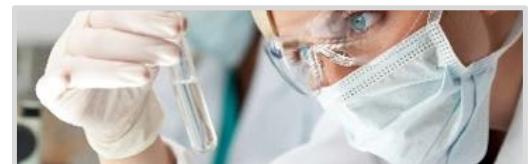
Quality Assessment Products (QAPs)