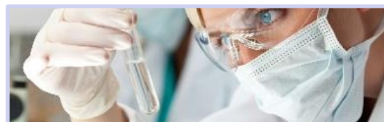
Quality Assessment Products (QAPs)