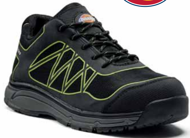
FC9527 Phoenix Safety Trainer