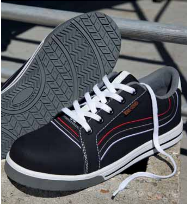
R337X Spark Safety Trainer