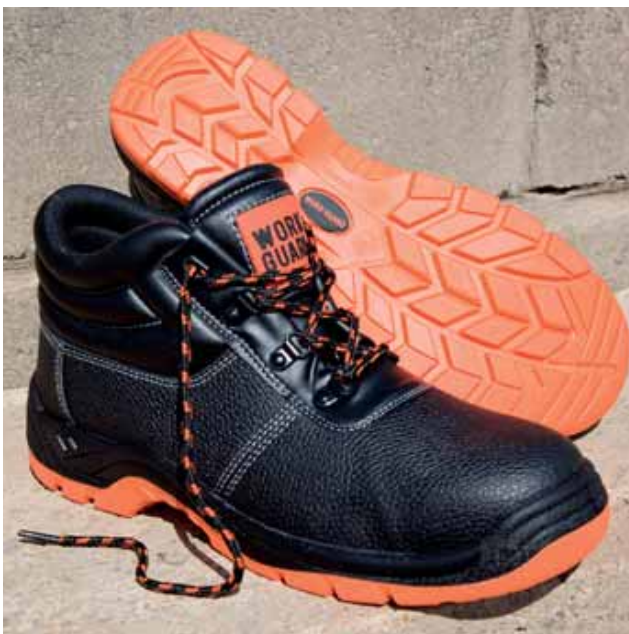
R340X Defence Safety Boot