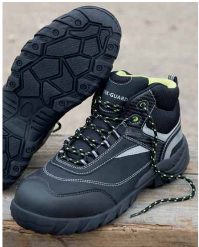
R339X Blackwatch Safety Boot