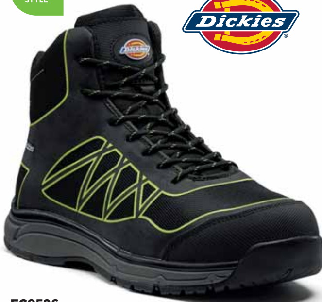
FC9526 Phoenix Safety Boot