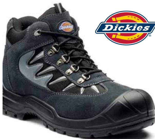
FA23385S Storm II Safety Boot

Weight: 732g Fabric: Suede & Mesh • EN ISO 20345:2011 S1-P SRC • Steel toe cap • Steel anti-penetration underfoot protection