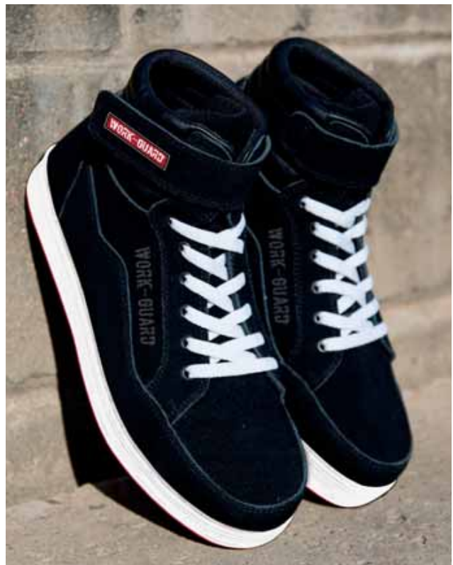
R342M Men's Reflect Safety Boot