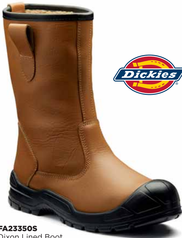
FA23350S Dixon Lined Boot

Weight: 844g Fabric: Leather • EN ISO 20345:2011 S3 SRC • Steel toe cap • Steel anti-penetration underfoot protection