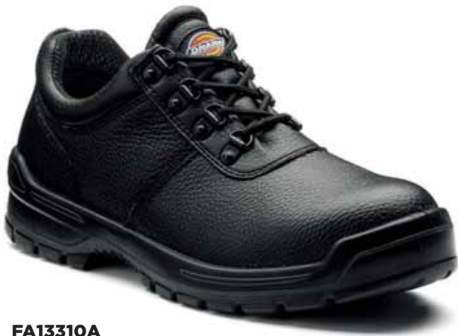
FA13310A Clifton II Safety Shoe

Weight: 650g Fabric: Leather • EN ISO 20345:2011 S1-P SRC • Steel toe cap • Steel anti-penetration underfoot protection