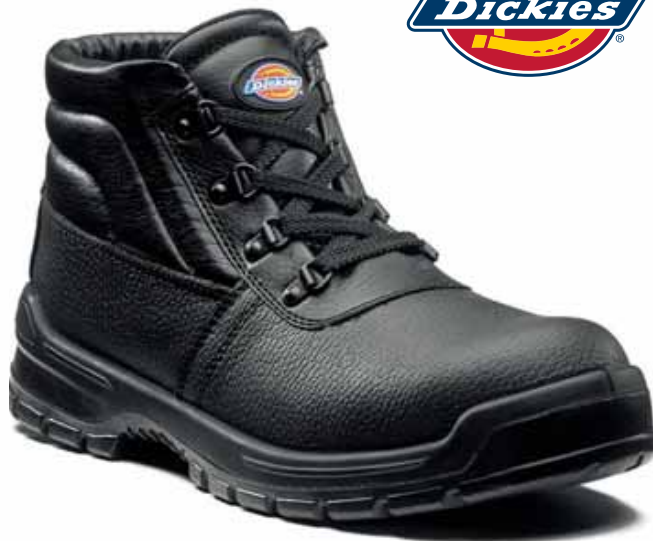
FA23330A Redland II Safety Boot

Weight: 700g Fabric: Leather • EN ISO 20345:2011 S1-P SRC • Steel toe cap • Steel anti-penetration underfoot protection