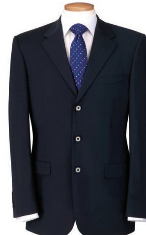
Centre back length at size 40R = 78cm