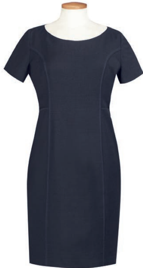
Centre back length at size 12R = 97cm

Codes & Colours: 2289A Navy 2289C Charcoal 2289D Black 2289G Light Grey 2289H Mid Blue