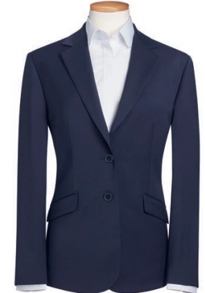
Centre back length at size 12R = 63cm

Codes & Colours: 2250A Navy 2250C Charcoal 2250D Black 2250G Light Grey