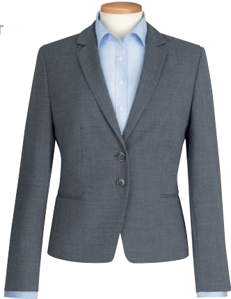
Centre back length at size 12R = 55.5cm

Codes & Colours: 2252A Navy 2252C Charcoal 2252D Black 2252G Light Grey 2252H Mid Blue