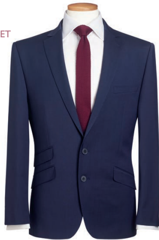
Centre back length at size 40R = 75cm

5985A Navy 5985C Charcoal 5985D Black 5985G Light Grey 5985H Mid Blue