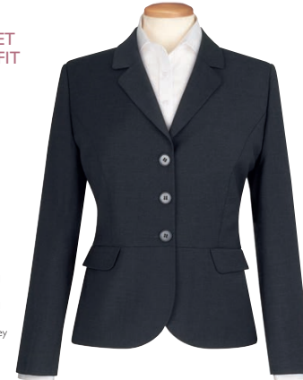
Centre back length at size 12R = 60.5cm