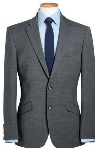
Centre back length at size 40R = 77cm

Sizes 34R to 56R available in solid colours only. Other colours available in sizes 36R to 52R. Sizes 34L and 36L available in colour A only.