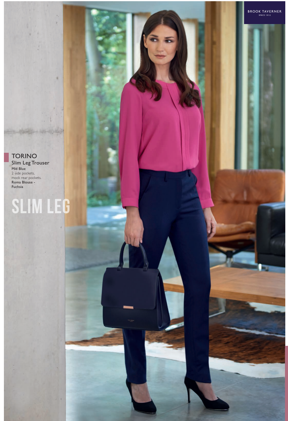
TORINO Slim Leg Trouser Mid Blue 2 side pockets, mock rear pockets. Roma Blouse - Fuchsia