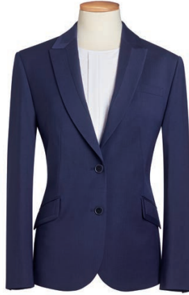
Centre back length at size 12R = 63cm

Size 18 petite available in solid colours only.