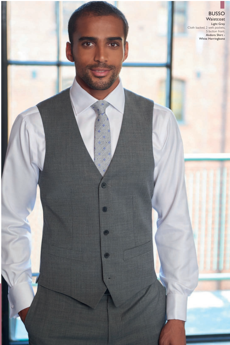
BUSSO Waistcoat Light Grey Cloth backed, 2 welt pockets, 5 button front. Andora Shirt - White Herringbone