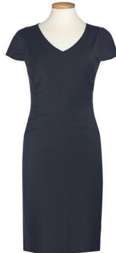
Centre back length at size 12R = 97cm

Codes & Colours: 2286A Navy 2286C Charcoal 2286D Black 2286G Light Grey 2286H Mid Blue