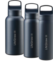
LifeStraw Go Series Stainless Steel (530ml, 700ml + 1L)