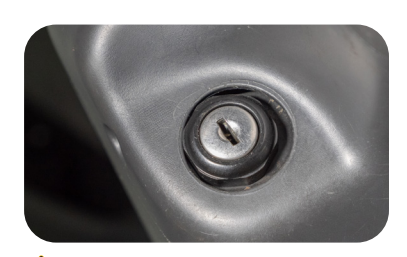
Leave key out of the ignition.

Turn the ignition off and remove the key.