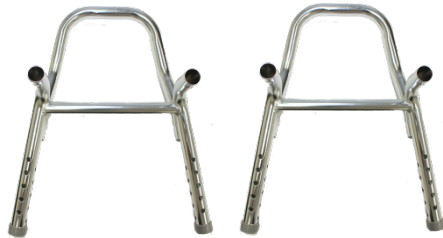
Part B & Part C