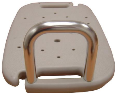
Fig.5 Place the hand rest on top of the seat and tighten the screws from the bottom.