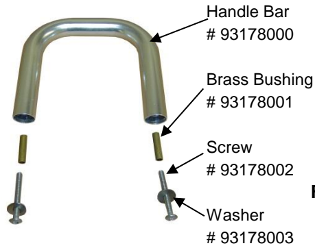
Fig.1 Parts list