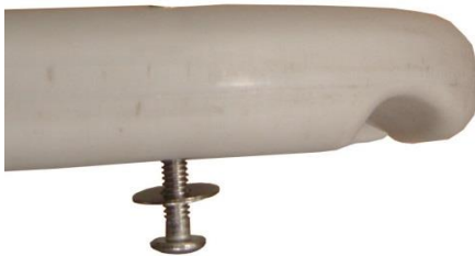
Fig.4 Insert washer and screw from the bottom.