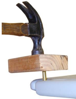
Fig.3 Push the brass bushing all the way down. If necessary, tap with a hammer using a piece of wood between them.