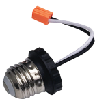
E26 Adapter included for easy retrofitting