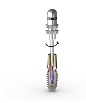
Using a .050 tapered hex driver, unscrew the fixation screw.

Permanent abutments are easily removed in the Implant One system with an abutment removal tool unique for a tapered implant connection.