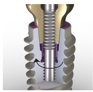
Continue to turn the abutment removal tool until the abutment releases from the tapered connection of the implant.