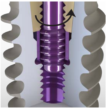
Continue turning the fixation screw counter-clockwise until it disengages the threads of the implant. You will feel it clicking when this happens.