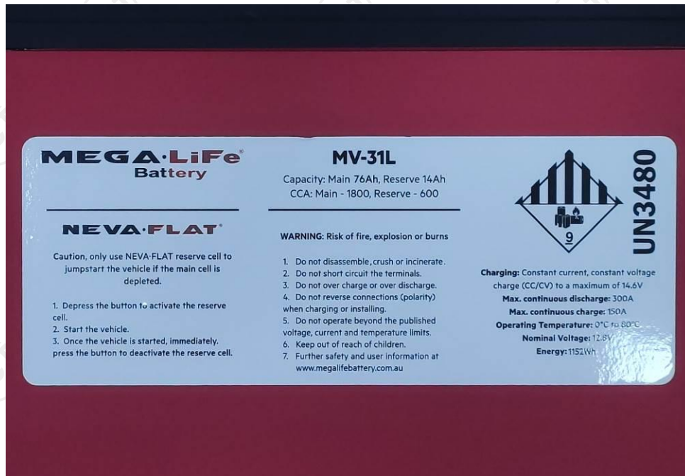
Picture 5. Label view