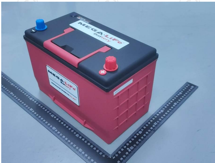
Picture 1. Battery view