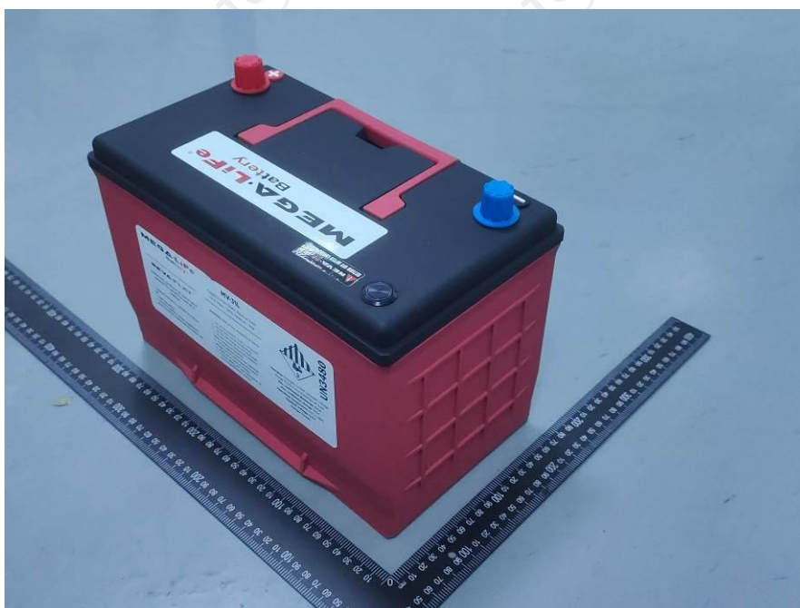
Picture 2. Battery view