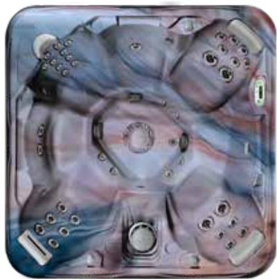
LUSTER SWIRL**, Tuscan Sun+