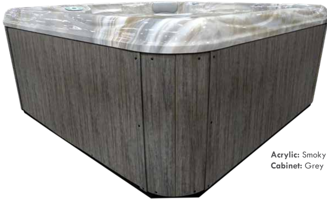
Acrylic: Smoky Mountains Cabinet: Grey

From the realistic wood-like texture to the matte finish, it's no wonder these cabinets are called Grandwood. They feature a tight grain pattern along with subtly varying shades of color. This subtle variance creates a more realistic look and feel of natural wood.