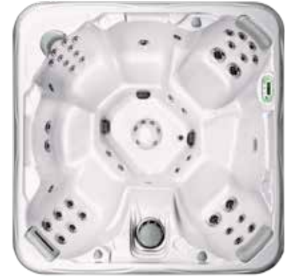
LUSTER**, White Pearl+