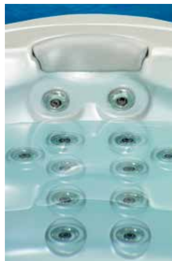
Stainless Steel Jets