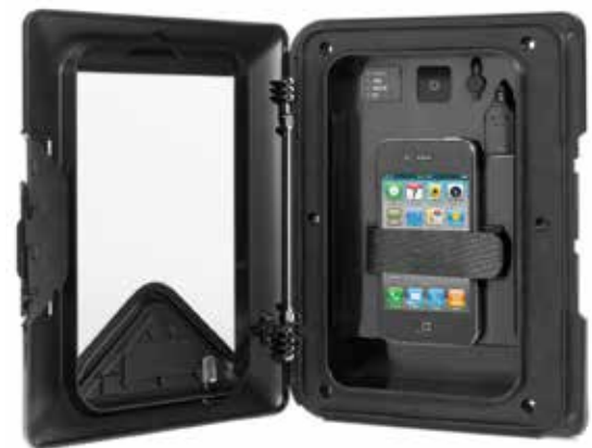
Aquatic Media Locker