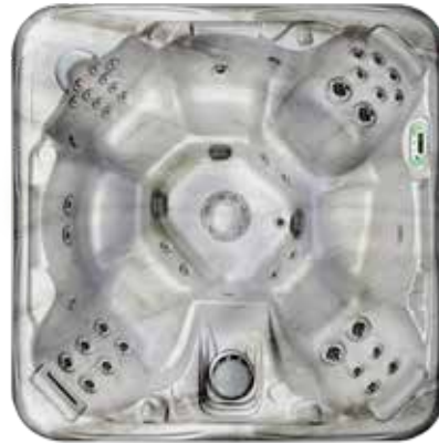
METALLIX**, Glacier Mountain+