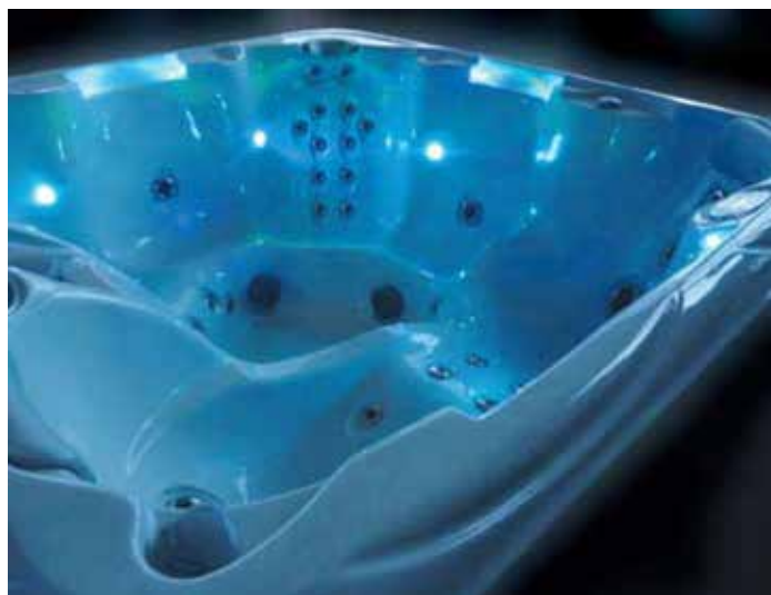
DynaStar LED Lighting