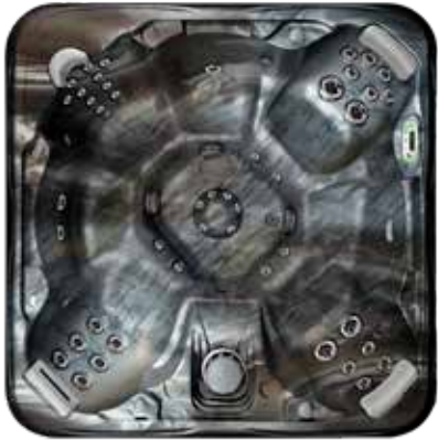
LUSTER SWIRL**, Midnight Canyon+

**Upgrade Colors | +965L Deluxe Available Color