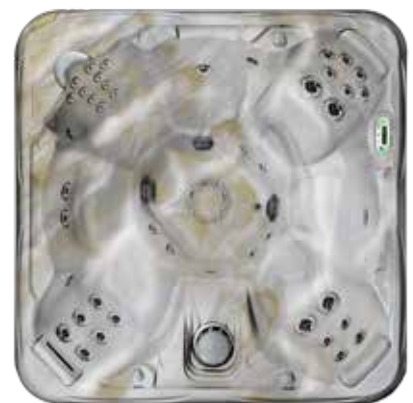
LUSTER SWIRL**, Smoky Mountains+