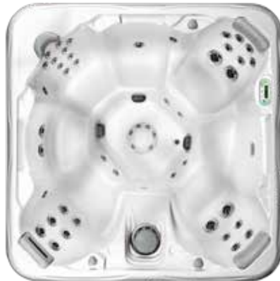
MARBLE, Silver Marble+