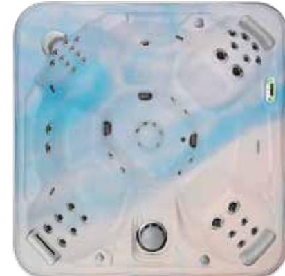
MARBLE, Wispy Blue