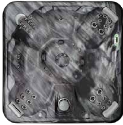
LUSTER SWIRL**, Storm Clouds