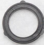
V-1000 3/4" Hose Washer