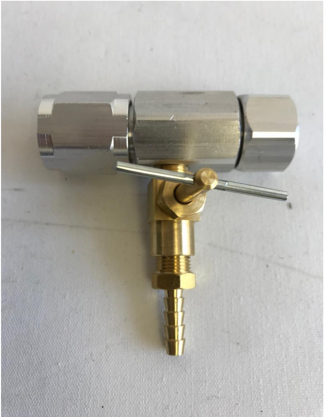
I-400-1-3 Pressure Booster Spray Head Complete (used with model I-400-1)