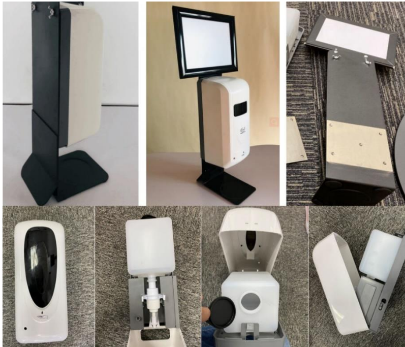
Table Top Automatic Dispensers offer a good way of cleaning hands. An automatic hand sanitizer dispenser comes with a sensor, and as soon as you place your hand under it, it dispenses the sanitizer instantly. There is no need to touch the dispenser itself, making it a very safe hand cleaning solution.

Hand sanitizers provide a convenient method of cleaning hands without requiring a sink and running water. Fast-dissolving sanitizer solutions clean users' hands and then dissipate, alleviating the need for rinse water or paper products for drying hands. This allows for a hand sanitizing station to be installed in places without having to install plumbing or other accessories.