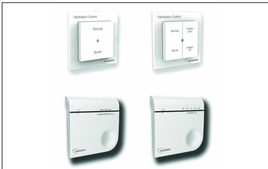
Figure 2 Typical controls and sensors

1.7 The systems incorporate a selector switch, allowing six settings. The setting required depends on the size and layout of the property and the level of moisture being produced in the property. The standard factory default setting is setting 2.