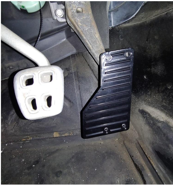
3. Place Pedal Extension (or template) over gas pedal.