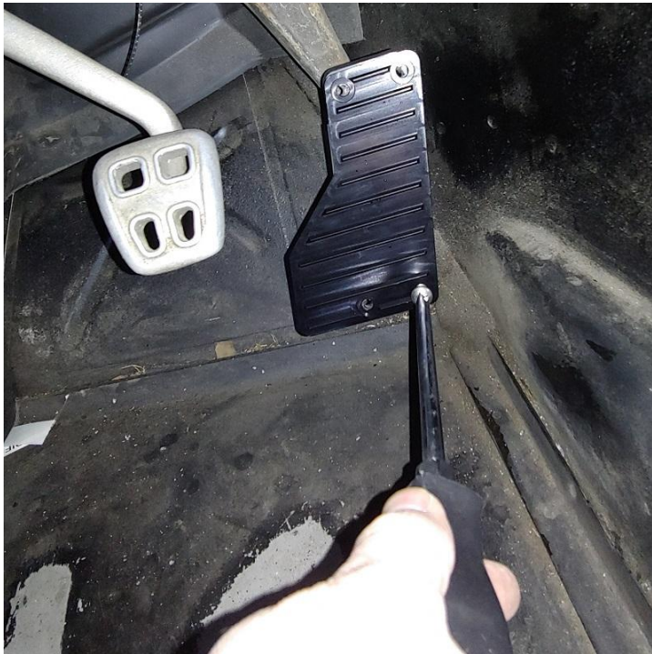
5. Secure pedal extension to gas pedal with provided screws. Proper torque value is Good'n Tite. The coarse threads and nature of the plastic should not allow these from ever coming loose thru normal use.