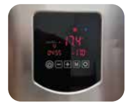
Built-in intelligent Touch Screen WiFi Controller