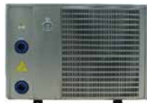
Concealed Rear Pipework & Diagnostic Gauge

Specifications subject to change without warning.