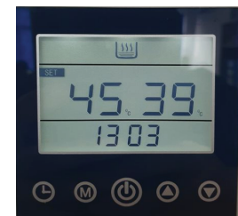
Intelligent touch screen controller