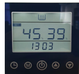
Intelligent touch screen controller