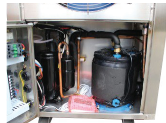
Hinged door panel for easy installation & access

www.coolenergyshop.com / sales@coolenergyshop.com