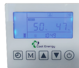
Intelligent touch screen WiFi controller

Specifications subject to change without warning.