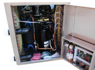
Hinged door panel for easy installation & access