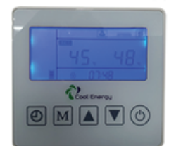
Intelligent touch screen controller