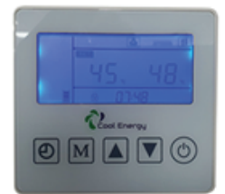
Intelligent touch screen controller