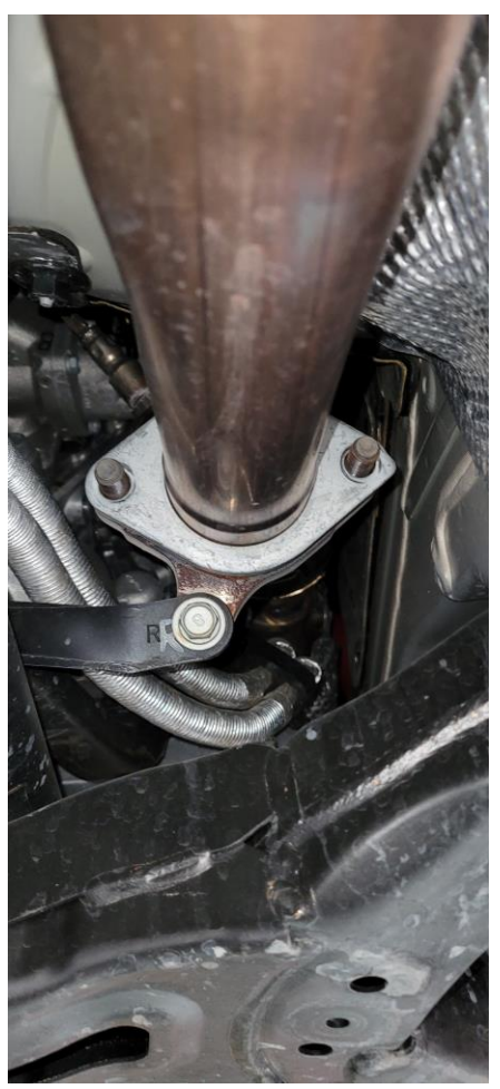
6. remove both secondary downpipes and set aside, remove both rear(downstream) o2 sensors from primary downpipes, set aside