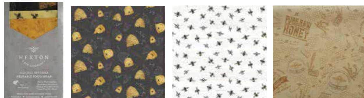
Queen Bee - a lovely set of beehives, bees & honey!