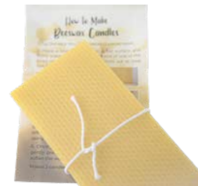
DIY Candle Kit Set of 3 RCDIY