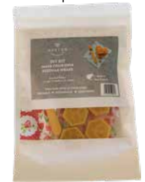
Extra Large HOXL