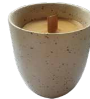
Woodwick Candle Natural WWN