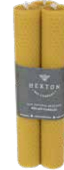
Pillar Candle 35x210mm Set of 3 RC3521