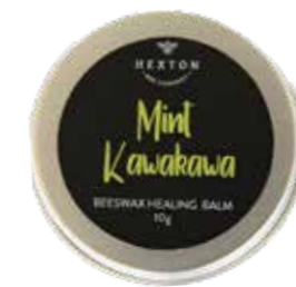
Mint Kawakawa Beeswax Healing Balm 10g OLB10