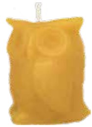
Owl Candle 40 x 35 mm MCOWL