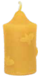
Round Bee Votive 35 x 65mm MCBV