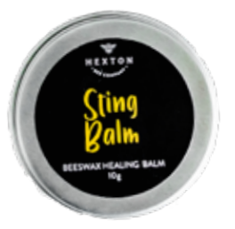
Sting Balm 10g STB10