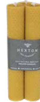
Pillar Candle 25x210mm Set of 3 RC251