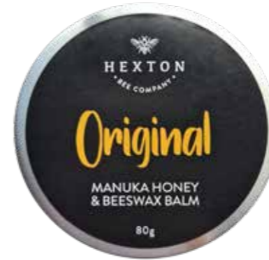
Original Manuka Honey & Beeswax Balm 80g OBB80

100% Natural, made with Beeswax and Manuka Honey from our own sustainably managed hives.