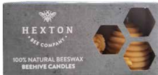
Beehive Candle Set of 3 MCBE