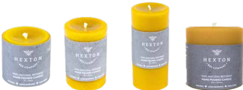
Solid Candle 75x75mm PC7575