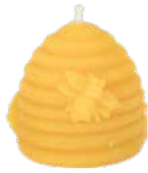
Beehive Candle 40 x 45 mm MCBE