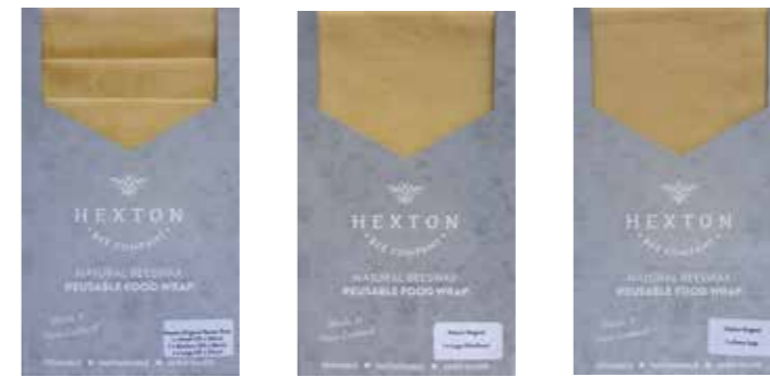
Starter Pack HOSP