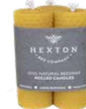
Pillar Candle 35x105mm Set of 3 RC3510