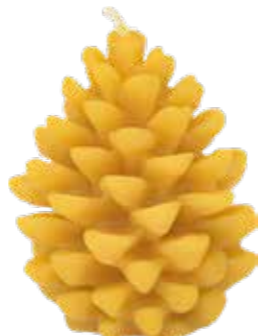
Large Pinecone 100 x 150mm MCLPC