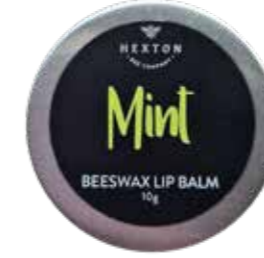
Mint Beeswax Lip Balm 10g MLB10