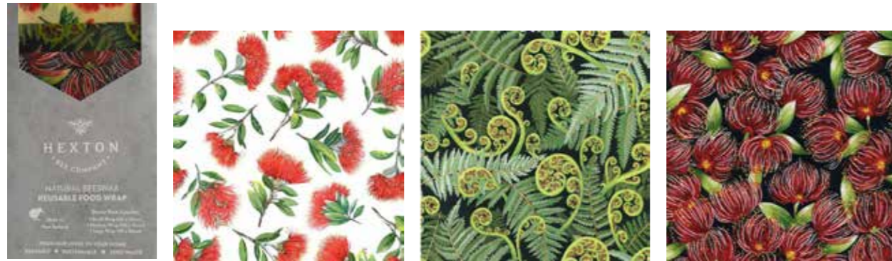
Kiwiana Koru - featuring beautiful NZ native pohutakawa flowers and wild koru's.

A free cardboard display box will be sent with all orders of 12 sets or more.