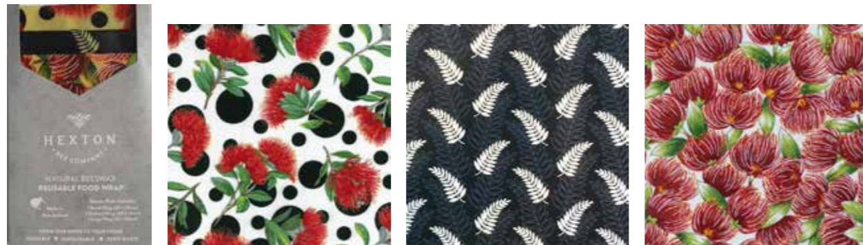
Kiwiana Fern - featuring the well known silver fern and pohutakawa flowers.