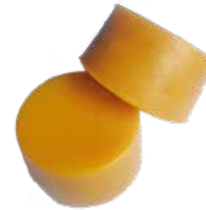
Beeswax Block 75g BWB

100% New Zealand Beeswax from our sustainably managed hives.