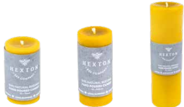
Solid Candle 45x75mm PC4575