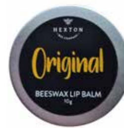
Original Beeswax Lip Balm 10g OLB10