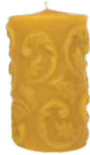
Fern Pillar 80 x 130mm MCFERN