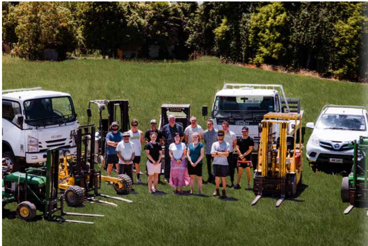
The Hexton Bee Company Team Gisborne, New Zealand.

At Hexton Bee Company we see our products as a natural collaboration between people and bees, using the fruits of our hives to create products that contribute to overall wellness for all.