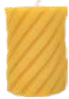
Spiral Pillar 60 x 85mm MCSPIR