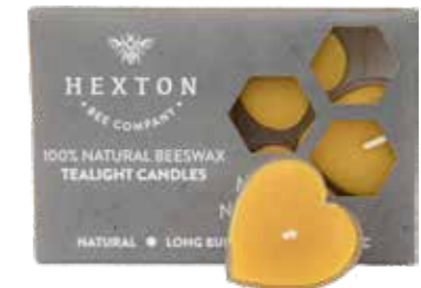
Heart Shaped Tealight Set of 6 HTC6