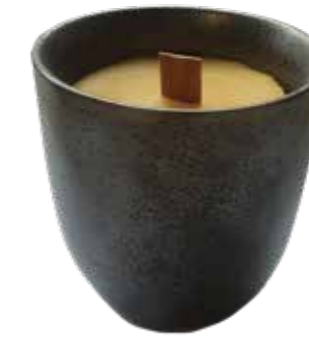
Woodwick Candle Black WWB