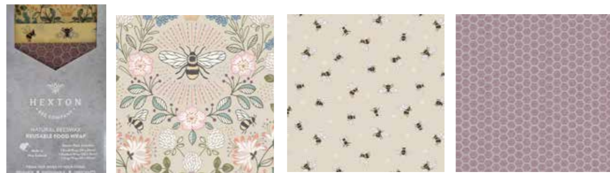
Chelsea - a delicate range of bees with lilac hues.