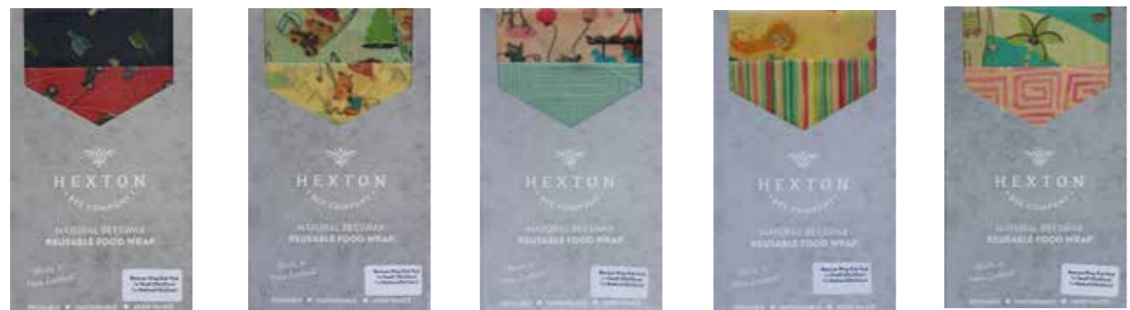
On the Move

Includes one small & one medium beeswax wrap