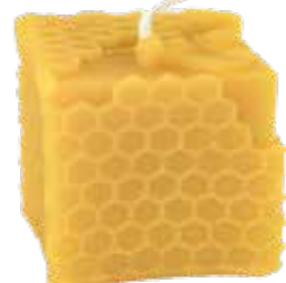
Honeycomb Cube 60 x 60mm MCHC