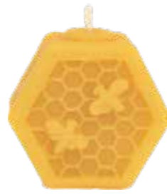
Hexagon Bee Votive 55 x 60mm MCHEX