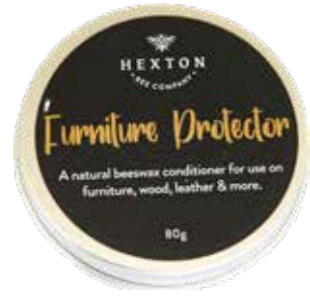
Furniture Protector 80g FP80

100% Natural Furniture protector and polish