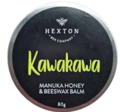
Kawakawa Manuka Honey & Beeswax Balm 80g KBB80