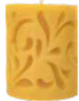
Swirl Pillar 70 x 90mm MCSWIR