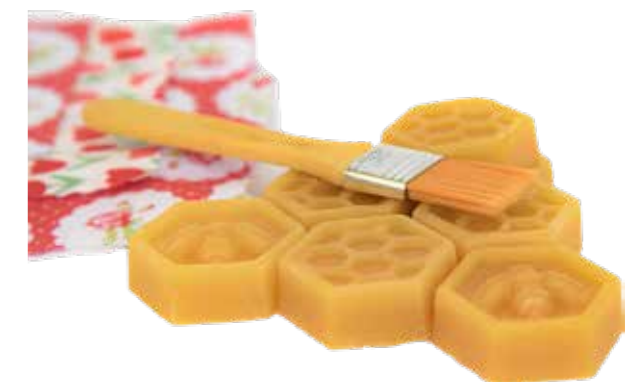
DIY Wrap Kit Set of 4 WDIY