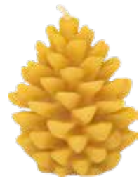
Small Pinecone 75 x 65mm MCPC