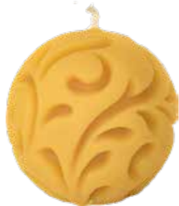
Ball Candle 85 x 85mm MCB