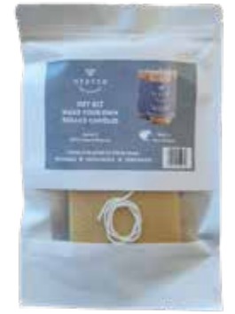
DIY Candle Kit 35x105mm Set of 3 RCDIY