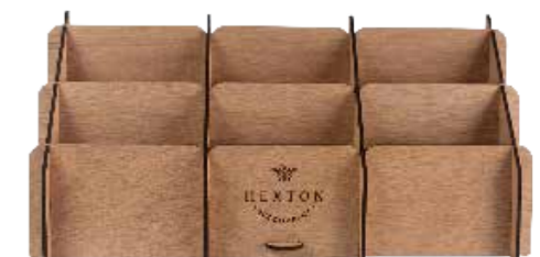
Medium (18 wraps)