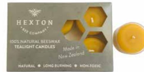
Round Tealight Set of 6 TC6