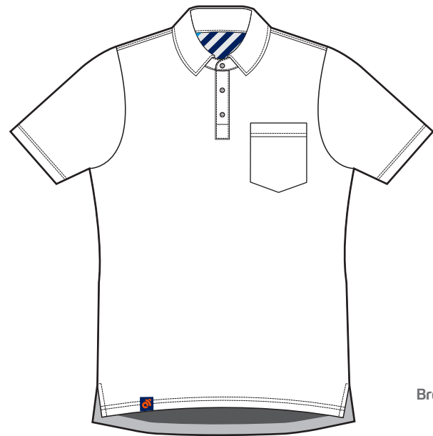
Brooklyn Polo (MCS126)