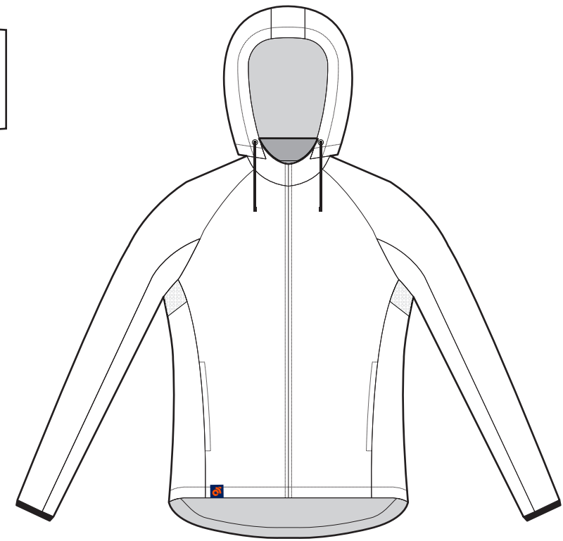
Bremen Windbreaker/ Copenhagen Inter Jacket (MUP035 / MUP036)