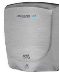
Stainless Steel Brushed