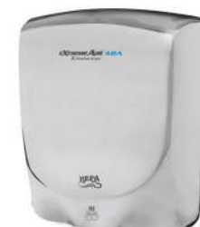
Stainless Steel Polished