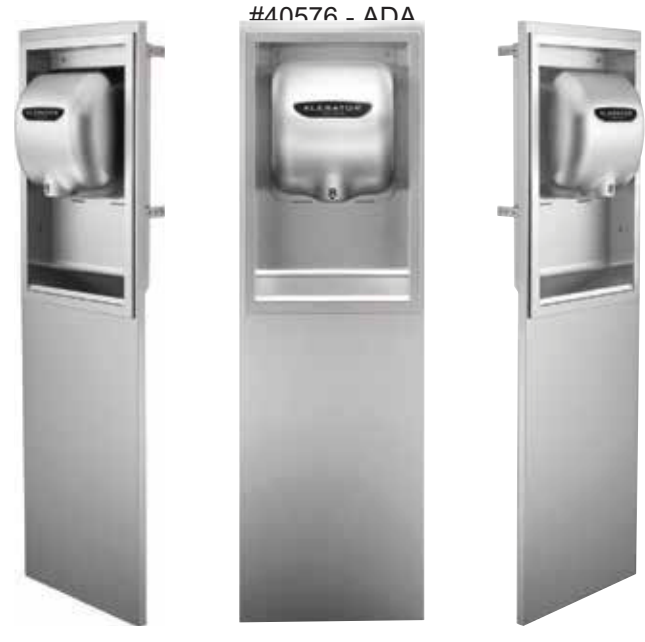
(XLERATOR Hand Dryer not included)