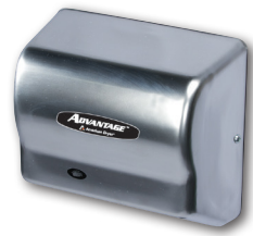
Steel Satin Chrome