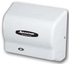
Steel White Epoxy