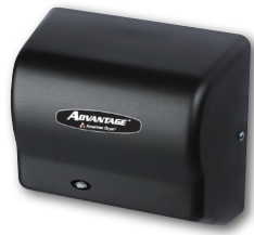
Steel Black Graphite