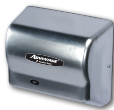
Steel Satin Chrome