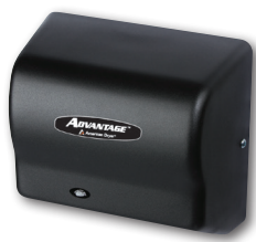
Steel Black Graphite