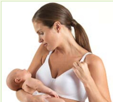
Average Cost Savings of Breastfeeding