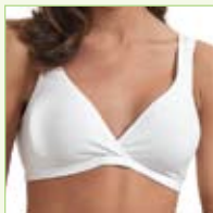
Pull to the Side