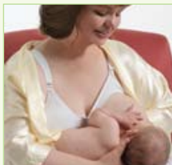
Cross Cradle Hold