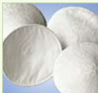
Washable Nursing Pads