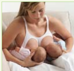
Double Clutch Football Hold