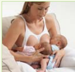
Cradle & Clutch Hold