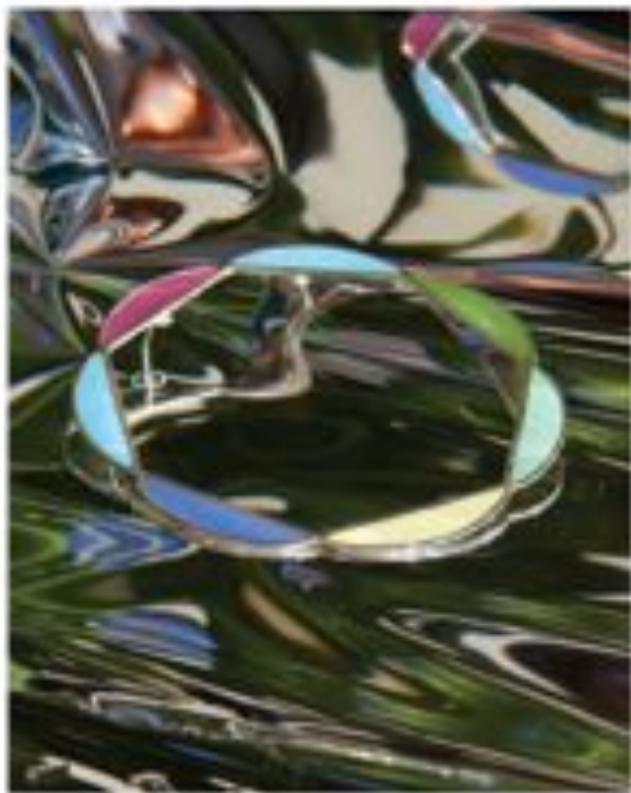
Large Arroyo Earrings in Sterling Silver with Resin | R12