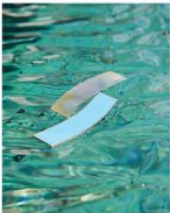
River Blues Earrings in Sterling Silver with Blue Resin | R10