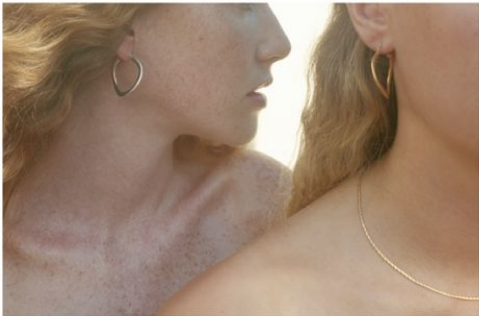
Wavy Hoops | R25