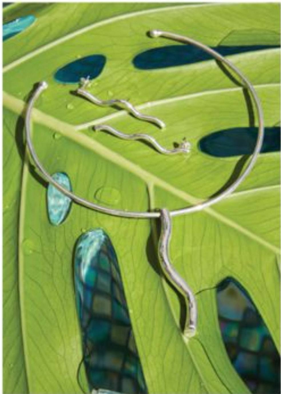
Onda Clicker Necklace in Sterling Silver | R Onda Earrings in Sterling Silver | R2