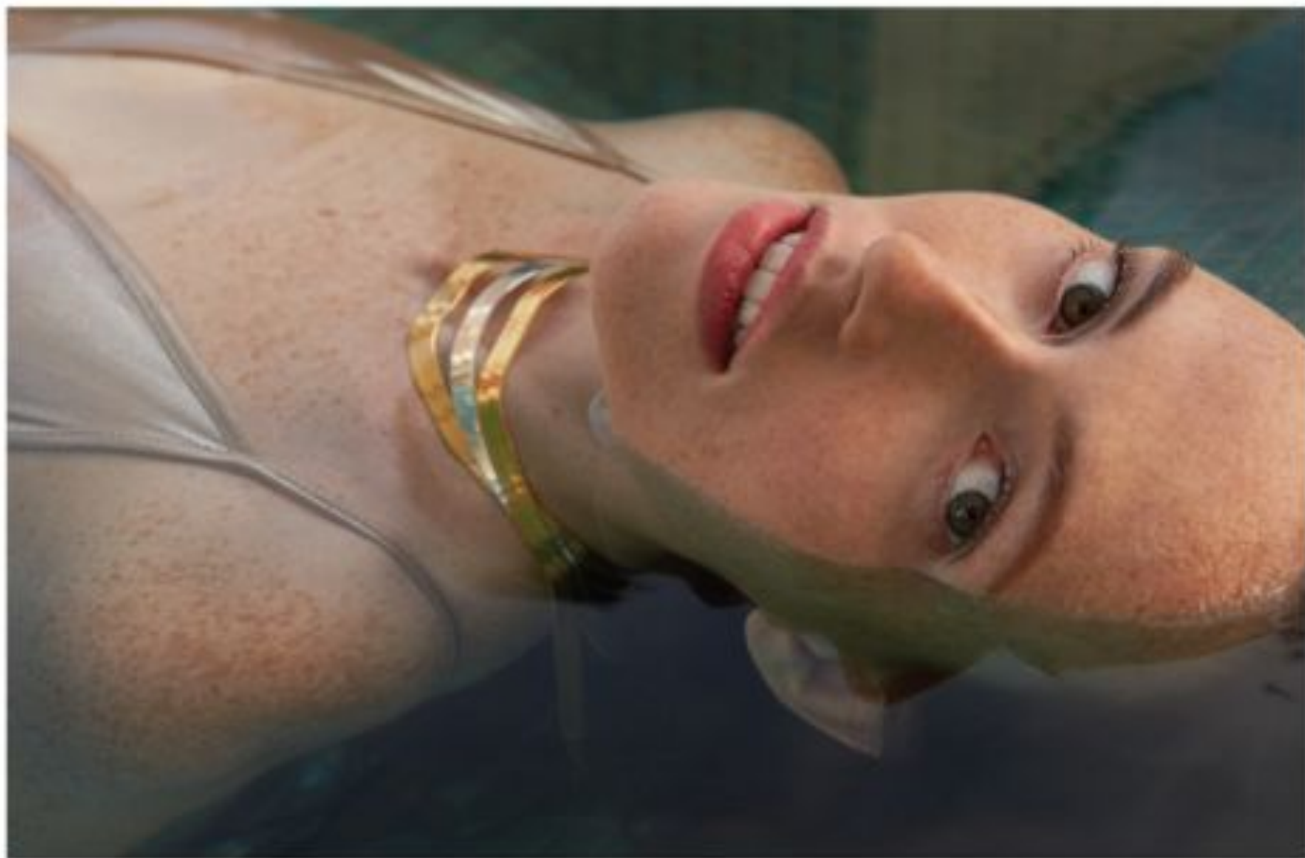
Snake Belly Necklaces. Sterling Silver and 14K Vermeil Plating | R16