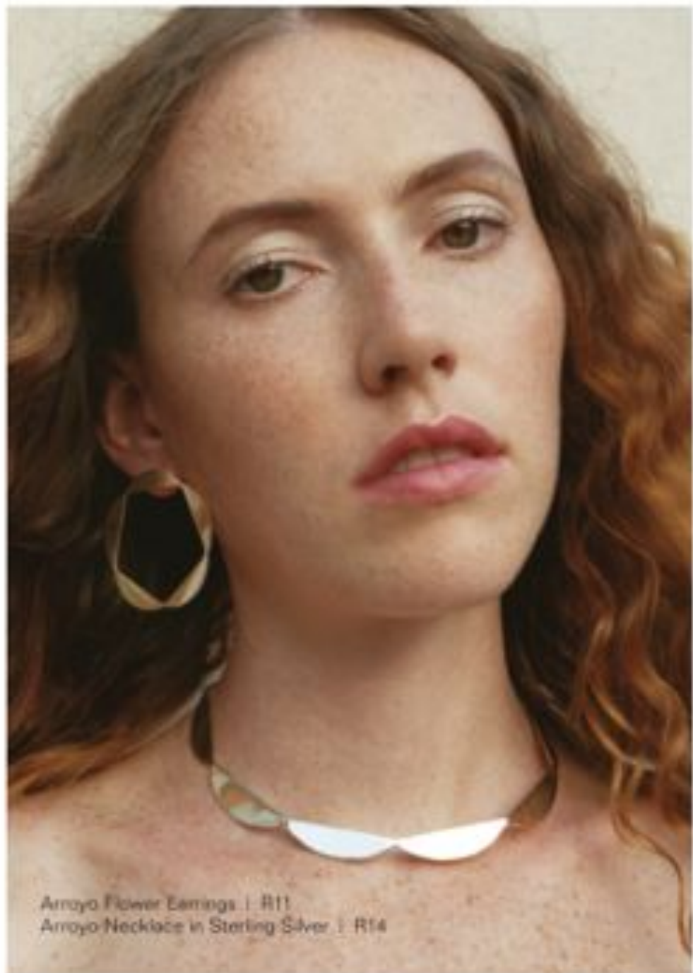
Arroyo Flower Earrings | R11 Arroyo-Necklace in Sterling Silver | R14