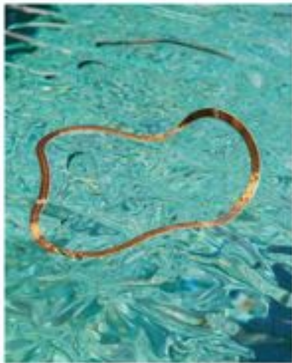
Snake Belly Necklace with 14K Vermeil Plating | R16