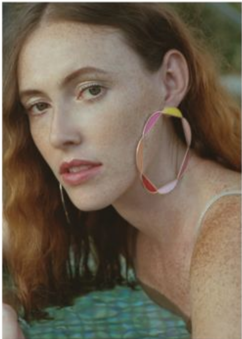
Large Arroyo Earrings in Sterling Silver with Resin | R13