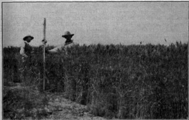
Fig. 7.—Side view of a 10-acre increase field of Improved Winter emmer. The estimated yield of this portion of field was 140 or 150 bushels per acre. The actual yield of the 10 acres was 691 bushels. Photographed at Worland, Wyo.

In the fall of 1909 a 10-acre field was sown to this seed. Earlier in the season the field had been sown to Canada peas, but a lack of water and the hot summer prevented the peas from making any profitable growth. A volunteer crop of spring barley and spelt came up and these and the few peas were cut for hay. The ground was then plowed, irrigated, and, in September, sown to the emmer, which made a small growth before freezing weather commenced. The rate of seeding was from 30 to 34 pounds per acre. In the spring