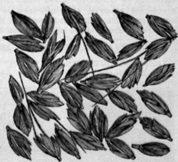
FIG. 2.—Emmer spikelets, showing short and pointed pedicel attached to base.

Emmer seems to have been found first in Switzerland and is grown in that country at present. It is also grown in Servia, Germany, Russia, Spain, and Abyssinia, and to some extent in France and Italy. A rather large quantity of emmer of excellent quality is produced in Russia each year. All our best seed of spring emmer is obtained from that country, and when grown in our northwestern plains yields a grain entirely equal in quality to that of the original. The average annual production of emmer in Russia