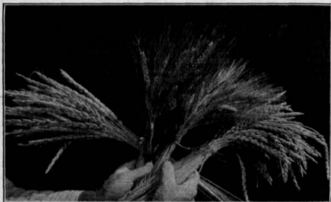
FIG. 8.—Two bundles of bearded grain, showing the black-glumed and white-glumed types of the sporting emmer, and two bundles of beardless grain, showing two hybrids which came true to the selection in the second generation. Photographed at Worland, Wyo.

Emmer is really a subspecies of wheat, and in actual experience it has been found that it can be readily crossed artificially with the