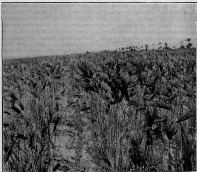
FIG. 6.—Increase plot of Improved Winter emmer, 1909. Rows 2\frac{1}{2} feet apart and plants about 4 inches apart in the row; yield at the rate of 42\frac{1}{2} bushels per acre. Photographed at Worland, Wyo.

and September on sagebrush bottom land which had been prepared in July; the soil being then dry and loose, the land was thoroughly irrigated before planting. The crop from the earliest planting was 5 to 7 inches in height at the beginning of winter. In the spring of 1908 it was found that only 72 plants had survived, the rest having been winterkilled. Among the survivors were a few which seemed to be of a different type, with large, coarse-growing straw and very large, composite heads which were different in appearance and