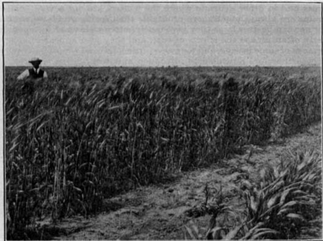
FIG. 5.—Field of Black Winter emmer (G. I. No. 2337) at the United States Experiment Farm, Channing, Tex., June 14, 1906.

While emmer has been grown for one or two years in a number of places, the grain-experiment farms controlled wholly or in part by