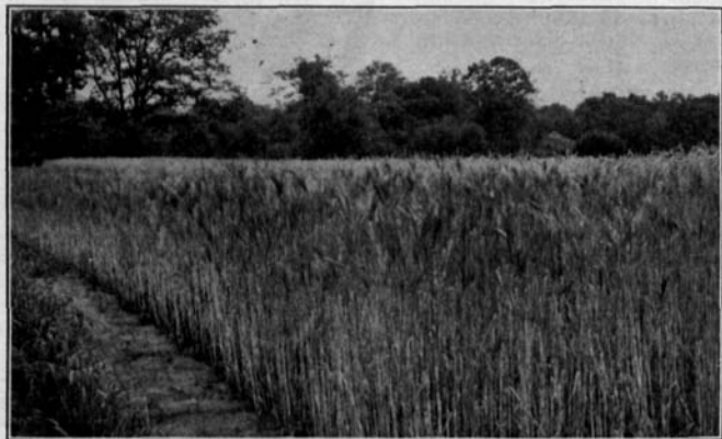
FIG. 4.—Black Winter emmer (G. L. No. 2337) at the Maryland Agricultural Experiment Station, June 21, 1906.

In a previous bulletin, the writer 1 entered into a general discussion of emmer, referring especially to spring varieties. Certain tests of