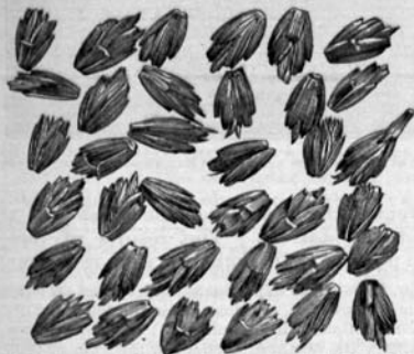
FIG. 3.—Spelt spikelets, mostly without pedicel attached to base, but usually with the pedicel of the next spikelet attached to face.

is about 10,000,000 bushels. The climate of the upper Volga region seems admirably suited for the growth of this cereal. The varieties grown there are almost wholly of the white-chaff group. In north Caucasus a considerable quantity of red-chaff emmer is produced. Emmer is also grown in Germany to a considerable extent, as is true spelt, hence the two cereals have been much confused, and it is partly for that reason, probably, that there has been such a confusion of names in other countries, into which both emmer and spelt have been introduced from Germany. Several varieties of emmer are grown in Servia, including an excellent white-chaff sort. Often the