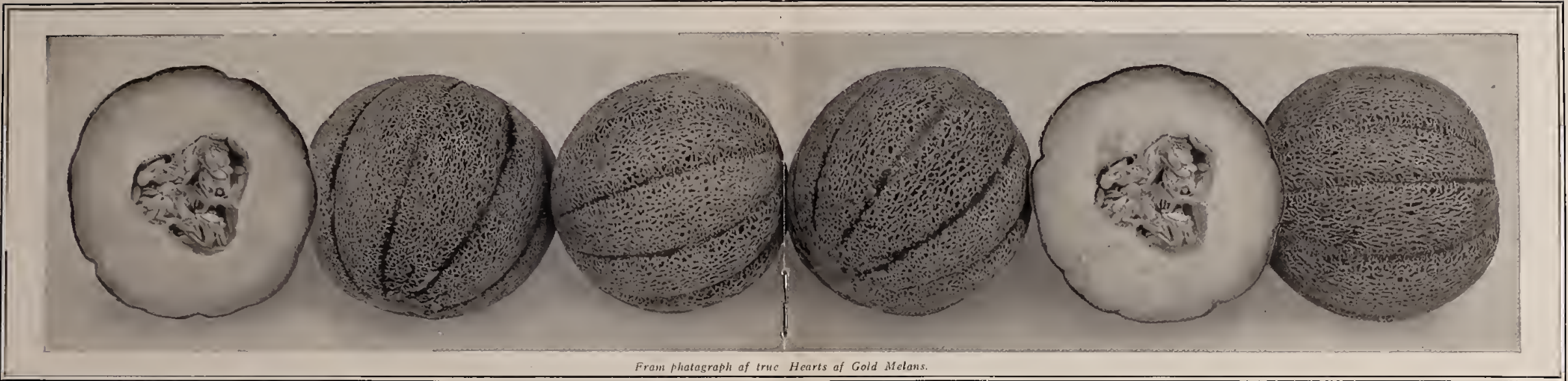
From photograph of true Hearts of Gold Melans.