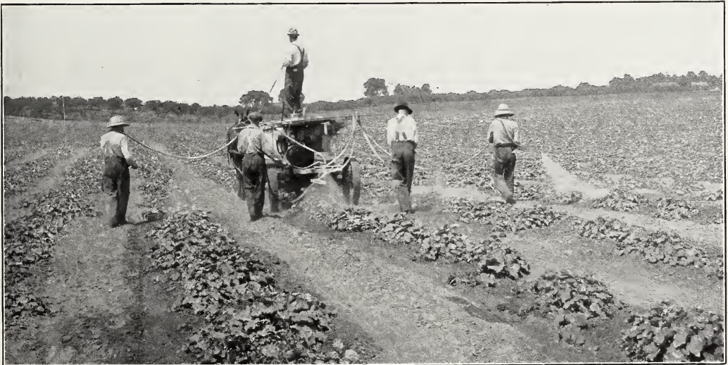
Spraying Melon Field. We Spare No Expense to Keep Our Vines Free From Disease.

"Pink Meat" type of cantaloupe has completely captured the best trade with the Hearts of Gold far in the lead where introduced. Already we hear with regret of plans to cheapen it by methods known to seedsmen but we shall continue to improve the variety by selection of perfect specimens from perfect vines.