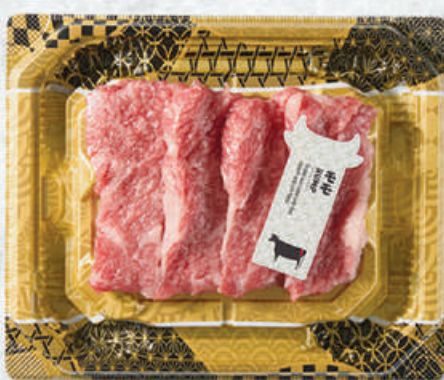
Yamagata Gyu Yamagata Chilled A5 Grade Yakiniku Set - Red Meat Yamagata Gyu 日本冰鮮 A5 級山形牛燒肉盤 - 赤身