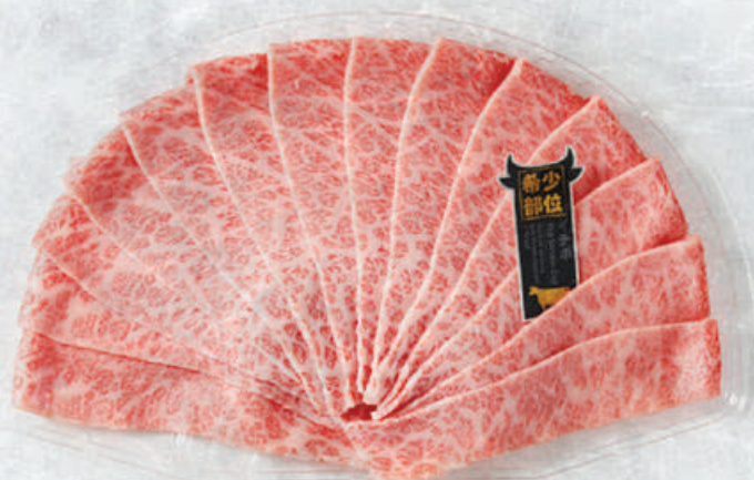
Yamagata Gyu Japan Yamagata Chilled A5 Grade Wagyu Beef Sukiyaki Set Yamagata Gyu 日本冰鮮 A5 級山形牛日式火鍋拼盤