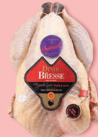
French Chilled Bresse Female Turkey AOP 法國冰鮮布烈斯火雞