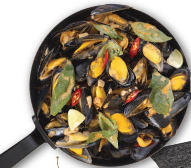
La Cancaise French Label Rouge Live Blue Mussel La Cancaise 法國紅標活藍青口

Comes with lemon and cocktail sauce 附檸檬和雞尾酒醬