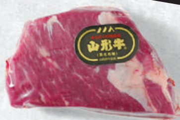
Yamagata Gyu Yamagata Chilled A5 Wagyu Beef Steak - Red Meat Yamagata Gyu 日本冰鮮山形 A5 級和牛牛扒 - 赤身