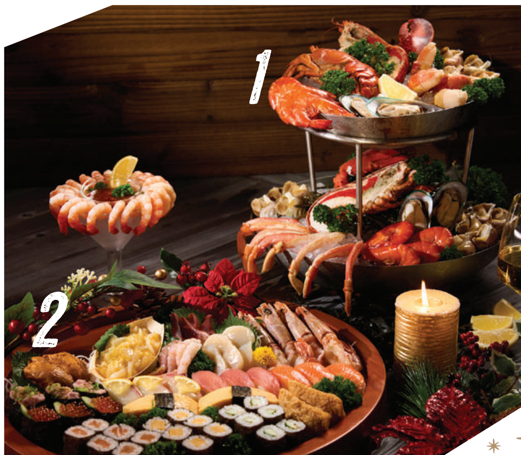
1 Seafood Platter 海鮮拼盤