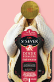
French Chilled Label Rouge Turkey 2.5kg above 法國冰鮮火雞 - 紅色標章 2.5kg 以上