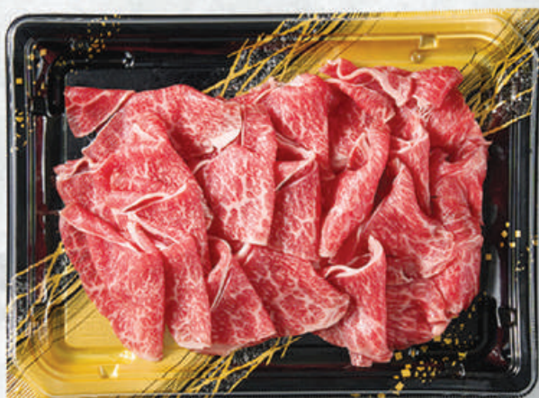
Yamagata Gyu Japan Yamagata Chilled A5 Grade Wagyu Beef Kiritoshi Set Yamagata Gyu 日本冰鮮 A5 級山形牛和牛萬用切盤