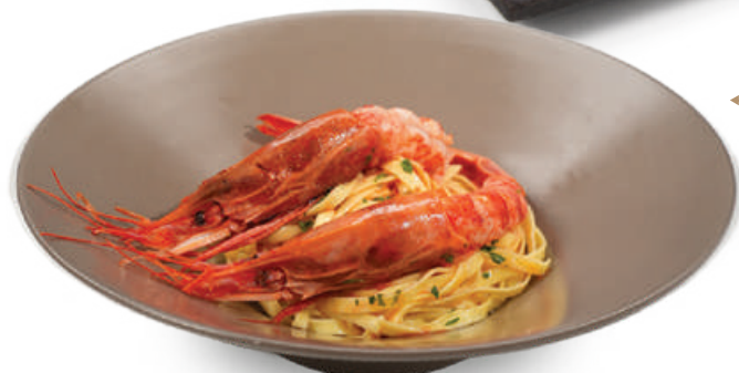
Spanish Red King Prawn Jumbo [Previously Frozen] 西班牙珍寶紅蝦 [經解凍處理]