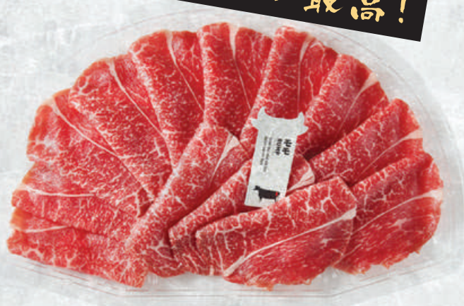
Yamagata Gyu Japan Yamagata Chilled A5 Grade Wagyu Beef Sukiyaki Set - Red Meat Yamagata Gyu 日本冰鮮 A5 級山形牛日式火鍋拼盤 - 赤身