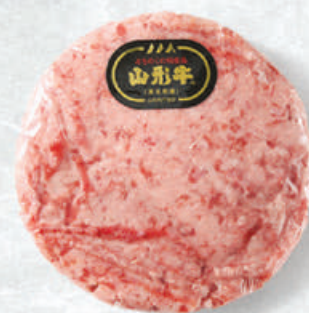
Yamagata Gyu Yamagata A5 Grade Wagyu Beef Burger [Previously Frozen] Yamagata Gyu 日本 A5 級山形 和牛漢堡 [經解凍處理]