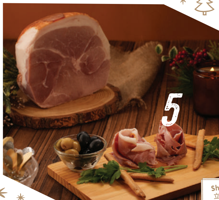
5 La Jabuguena Iberico Cooked Ham La Jabuguena 西班牙伊比利亞 黑毛豬熟火腿