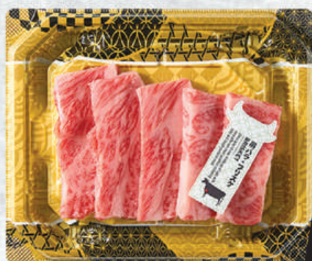
Yamagata Gyu Yamagata Chilled A5 Grade Yakiniku Set Yamagata Gyu 日本冰鮮 A5 級山形牛燒肉盤

city'super 獨家每月直接從山形縣採購頂級原頭山形乙女牛，讓您以超值價格享用不同部位。山形牛的脂肪熔點低至14.6°C，入口即滲出迷人的牛脂香氣，肉質柔嫩且肉味濃郁。