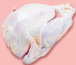
UK Chilled Organic Turkey Bronze 英國冰鮮有機火雞

city'super 提供多款優質火雞，皆採用戶外自由放養，經過悉心照料，自然生長，無激素添加，確保火雞肉質細嫩及風味獨特。