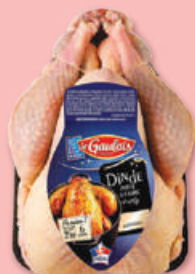
French Chilled Turkey 2-3kg 法國冰鮮火雞 2-3kg