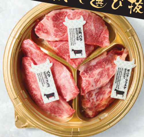
Yamagata Gyu Japan Yamagata Chilled A5 Grade Yakiniku Set Yamagata Gyu 日本冰鮮 A5 級山形牛燒肉拼盤