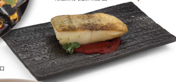
Glacier 51 Australian Patagonian Toothfish Fish Slice [Previously Frozen] Glacier 51 澳洲 G51 小鱗犬牙 南極魚塊 [經解凍處理]