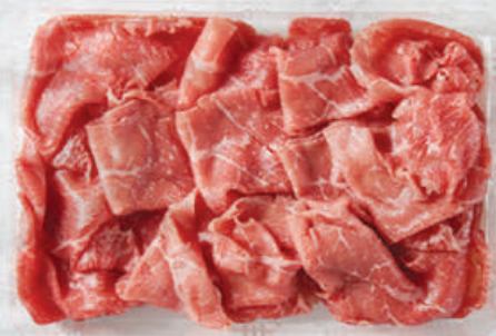
Yamagata Gyu Japan Yamagata Premium Wagyu Beef Kiritoshi Set - Small Yamagata Gyu 日本冰鮮 A5 級 山形牛和牛萬用切盤 - 小份