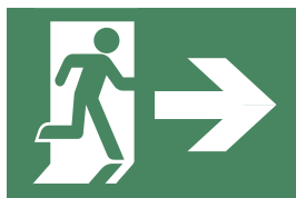
Arrow Right (1pc)