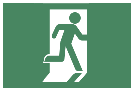
Without Arrow (2pcs)