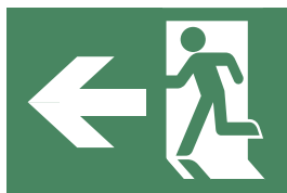
Arrow Left (1pc)

The RMPC provides two pictograms with no directional indicators, a pictogram with a left facing directional indicator and a pictogram with a right facing directional indicator, as well a one blank panel.