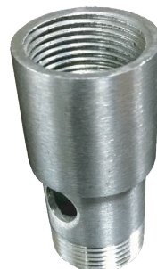
3/4" Threaded Pendant Adaptor (optional)