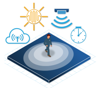
Compatible with controls and integrations