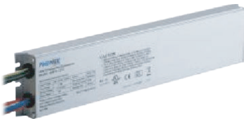
Phenix Internal Emergency Inverter (18470X-2) (optional)