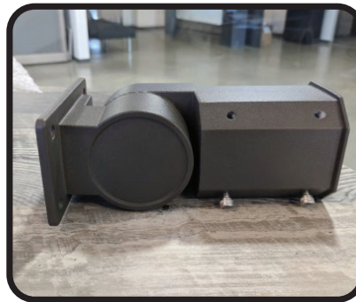
Slip Fitter Mount