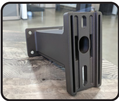
6" Extruded Arm Mount