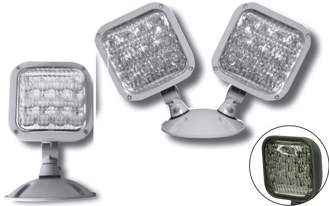
Also available in Thermoplastic