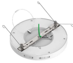
7" & 12"