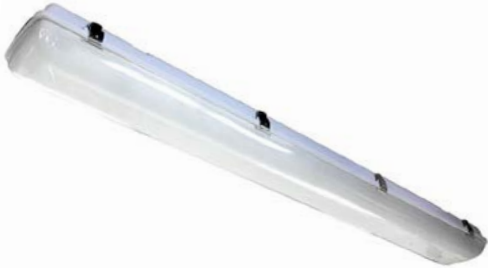
48" LED Vapor Tight w/ Translucent Lens