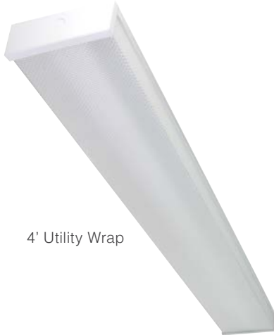
4' Utility Wrap