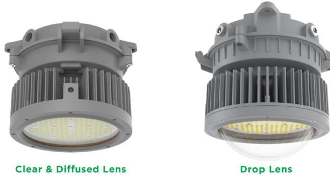
Clear & Diffused Lens