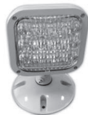
Single Lamp with Weatherproof (WP) Option