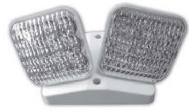
Double Lamp with No Options