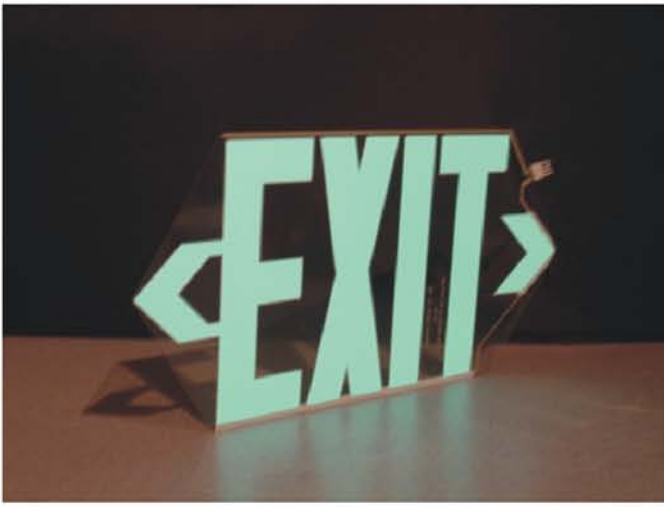
Exit Sign Lamp Panel