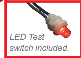
LED Test switch included.