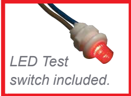
LED Test switch included.