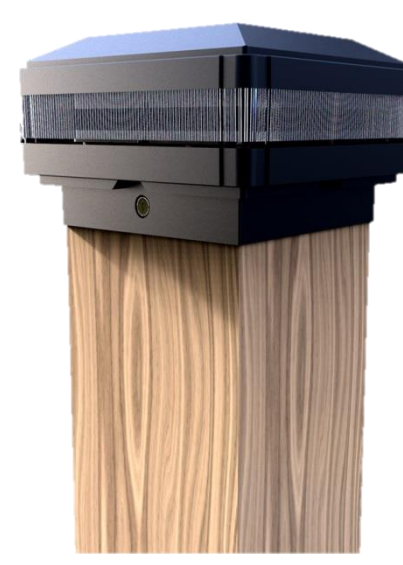
*Post not included