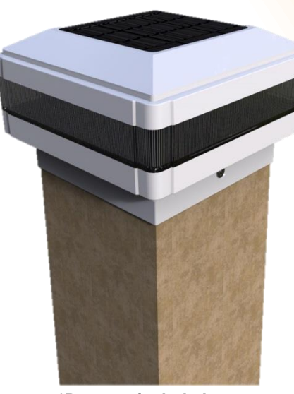
*Post not included