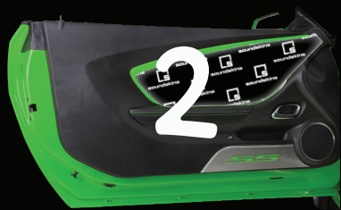
Driver Side Door Panel Insert