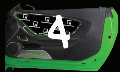
Passenger Side Door Panel Insert