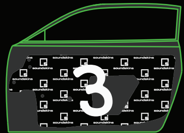
Passenger Side Door Pc